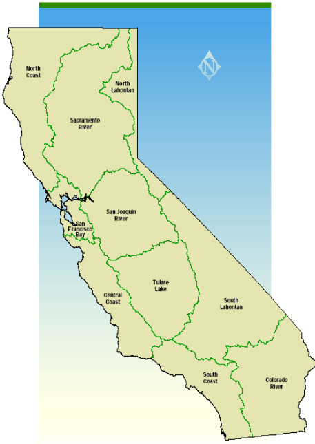
FIGURE 5.2 California's Hydrologic Regions