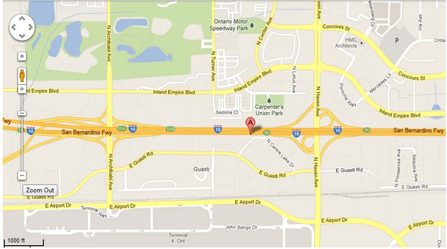
Directions from 10 Freeway East